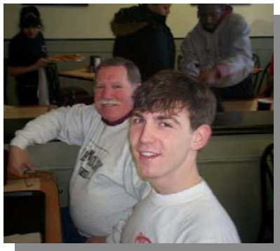
Our illustrious state leaders enjoying one of the Brotherhood events.